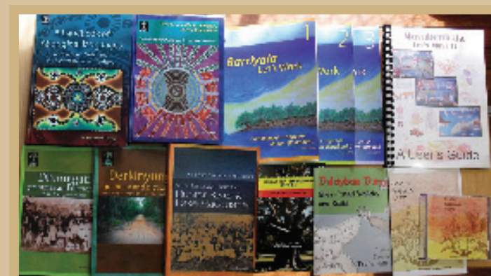
Our range of publications

For more information, and to place an order, go to www.muurrbay.org.au or email your order to mralcadmin@westnet.com.au