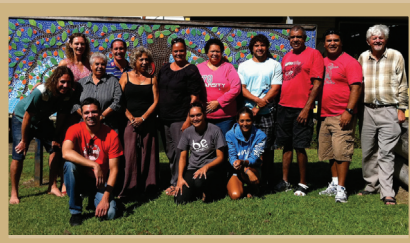
2012 Gumbaynggirr language class at Muurrbay

Muurrbay is a registered training organisation and is based in the old church on Bellwood Road where Gumbaynggirr language classes began in 1997. We continue to grow as a centre for Aboriginal language and cultural activities, including teaching Gumbaynggirr language to adults and supporting Gumbaynggirr language teachers in schools; working with local artists and musicians; and encouraging the use of Gumbaynggirr in all areas of life.